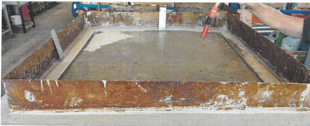
Figure 1: Watertightness test set up – flooding - ACO Access Cover PAVING H80 assembly 600x600 D400