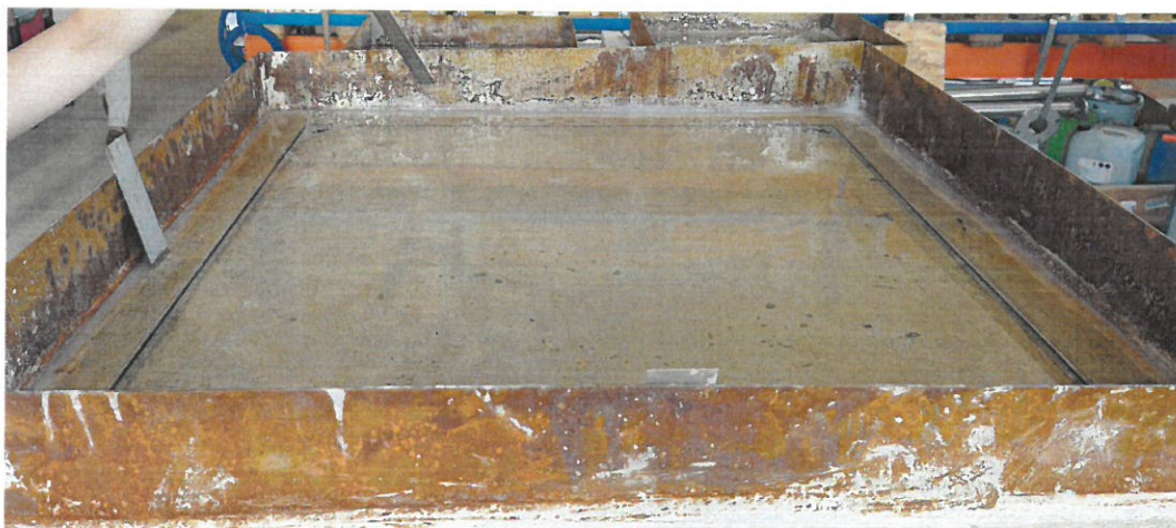
Figure 3: Watertightness test set up – ACO Access Cover PAVING H80 assembly 600x600 D400