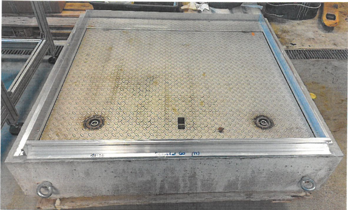
Figure 1: Watertightness test set up - ACO Access Cover Servokat 800x1000 B125 emergency exit 1.4301